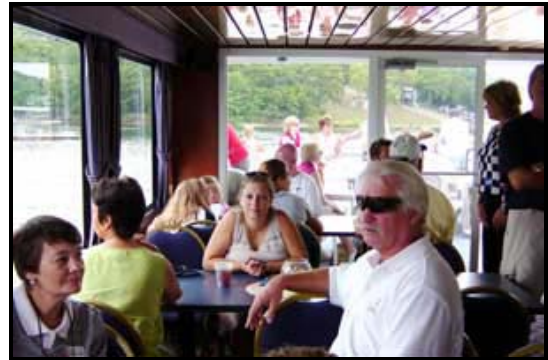
Customers enjoying a luncheon cruise aboard the Tropic Island.

Dinner was provided in the Portside Restaurant and Lounge and what a dinner it was. If you have not had an opportunity to dine at the Holiday Inn SunSpree Resort, I suggest you give them a try, you will not be disappointed.