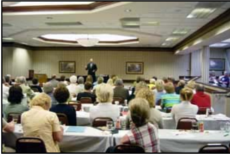
Speakers Bureau showcase.