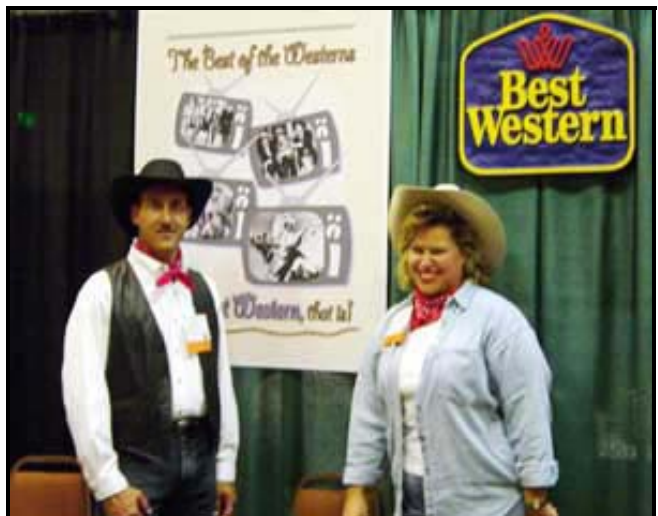
Best Western Capital Inn