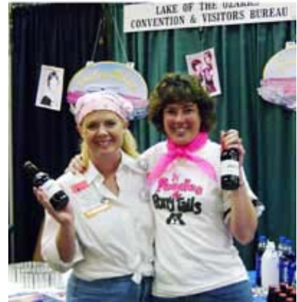
Lake of the Ozarks CVB