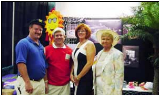
Holiday Inn SunSpree, or is it the crew from Gilligan's Island?