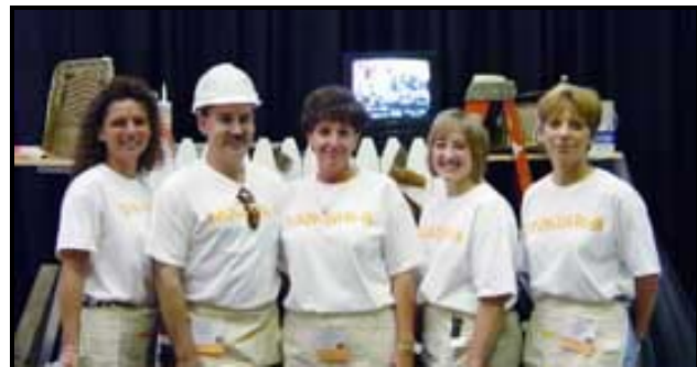
Home Improvements at Tan-Tar-A Resort