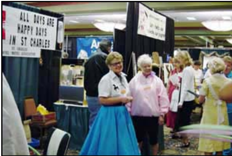
Happy Days in St. Charles.