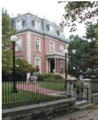
Missouri Governor's Mansion